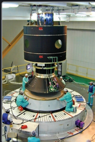
MAQSAT-B2 on L521 – Maquette Satellite