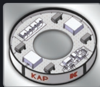
Platform for auxiliary payloads configuration

Raising cylinder configuration with KAP Kit mounted on internal platform